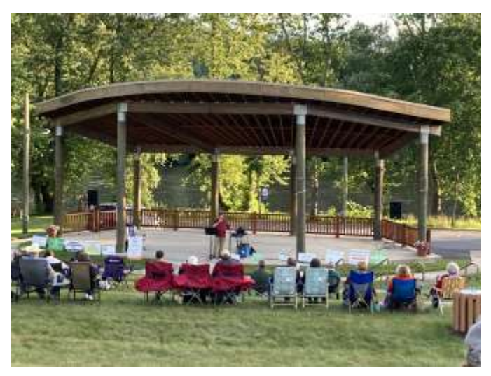
This year's first Concert in the Park