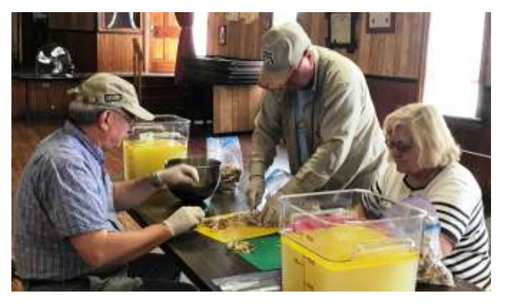
Some of the volunteers from Perry Valley who recently helped with preparations for the Pomona Grange fair concession.